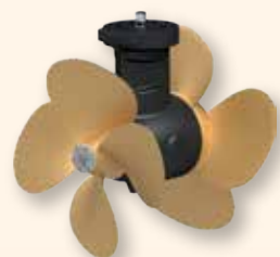
Shallow draught performance